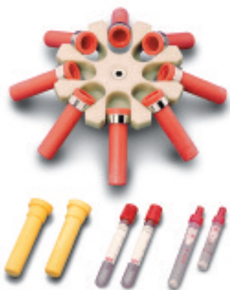
Swinging Bucket Rotor